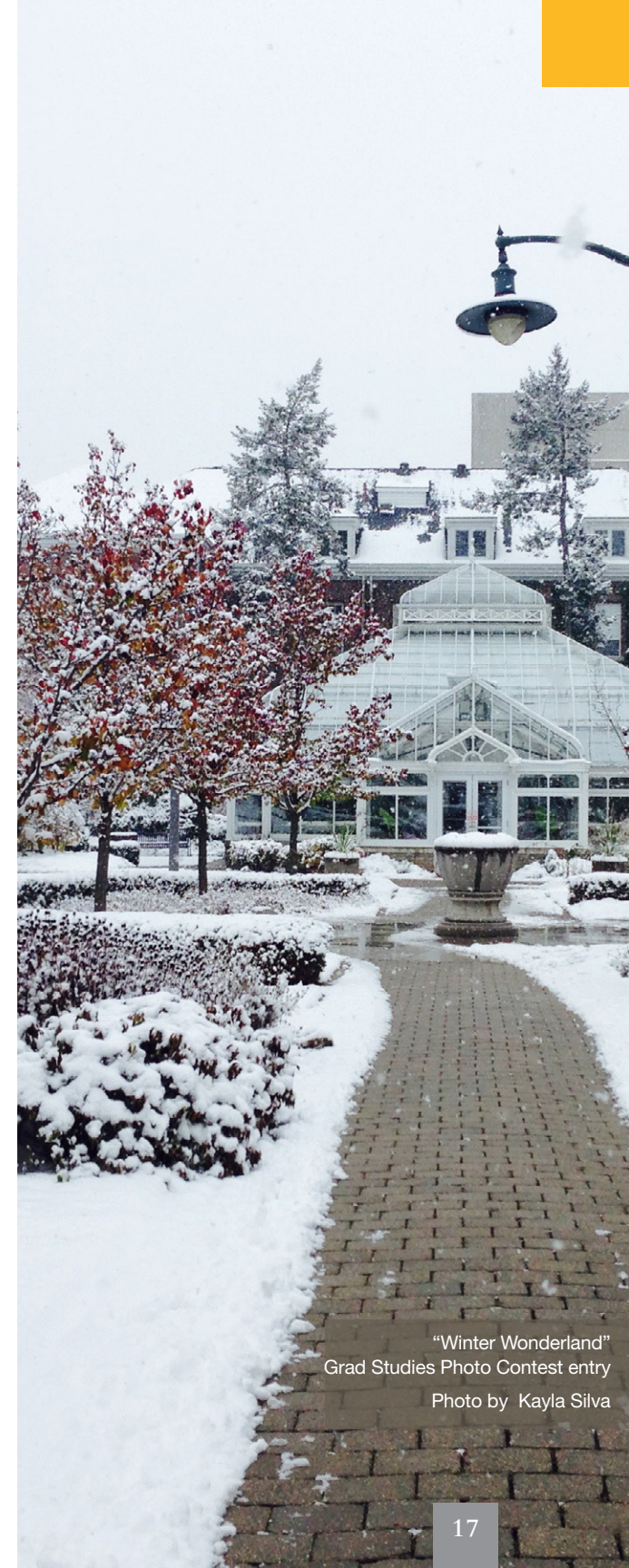
"Winter Wonderland" Grad Studies Photo Contest entry

The Guelph Gryphons Athletic Centre is a new, state of the art 25,000 sq. ft. fitness centre. The facility features a suspended running track, varsity basketball, and volleyball courts, a climbing wall and numerous multipurpose rooms for fitness and recreation activities.